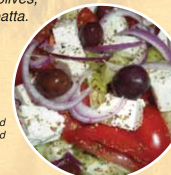
Feta, Olive and Tomato Salad

Feta, Olive and Tomato (v) £7.95 Mixed leaf salad with cherry tomatoes, olives, Feta cheese and served with garlic ciabatta.